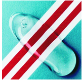
19 times clearer than silicone.

All purpose: Lexel is a co-polymer rubber-based sealant. It has excellent adhesion to a wide variety of materials, even after seven days of water immersion. Although it's tougher and resists tearing, Lexel is a soft rubber. This allows it to stretch and compress with joint movement.