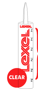
Lexel's handy gauge printed on the side lets you determine how many "caulking feet" of Lexel remain.

Make sure the room is well ventilated if using Lexel indoors.